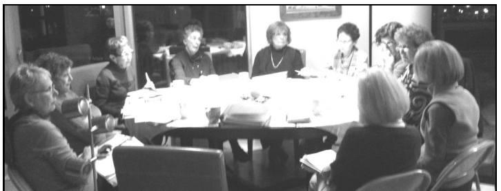
Our very own "knights of the round table" Cabinet hard at work.